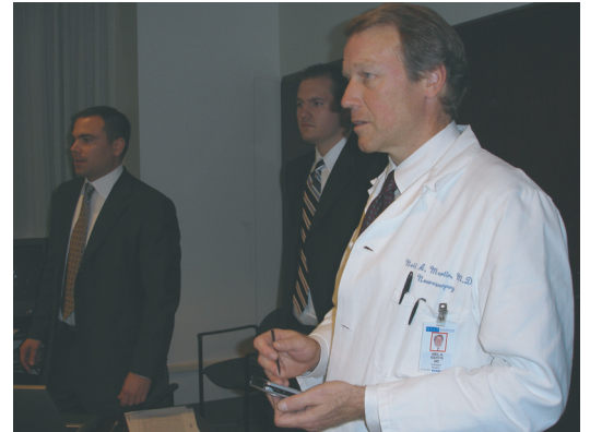
Dr. Neil Martin, Chief of UCLA Neurosurgery, using VisionTree wi-fi enabled handheld device to input ratings.

The top 20 candidate scores generated using the software ranged from 80 to 100 and were presented in order of statistical preference. Since a ranking of the candidates was also conducted by the group using a white board, the two ranking techniques have been compared through a correlation and regression analysis (See Page 2).